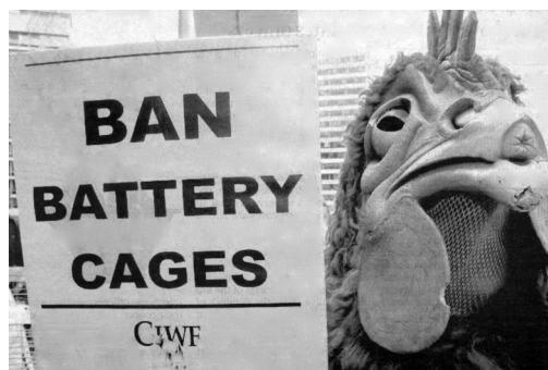
An animal rights activist protests European Union farm policy in Brussels.